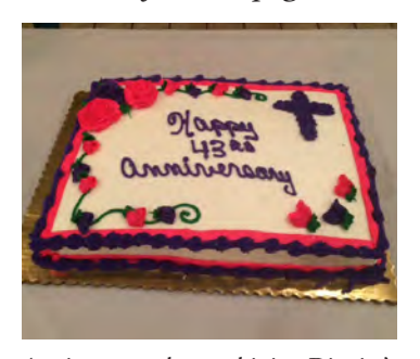
Anniversary cake combining Dignity's 43rd and Ron Hoskins' celebration (note purple cross).